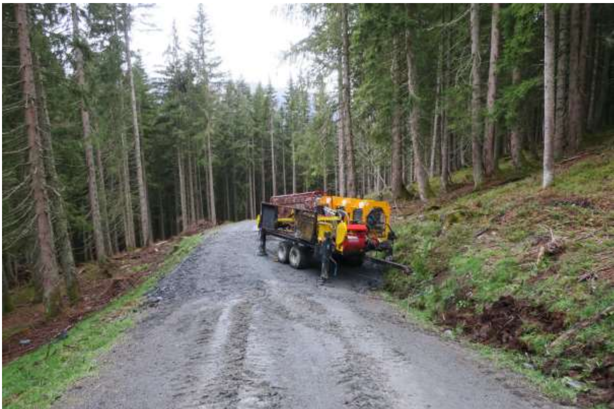
Figure 3 – Rig 2 setting up morning of 3 rd October, drilling end of day