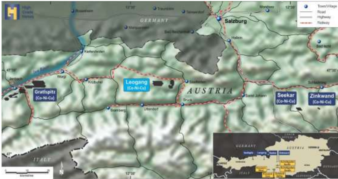
Figure 3 – Location map showing the Company’s Cobalt, Copper and Nickel Projects in Austria

The project lies within an exploration area of 2 overlapping Freischürfe covering an area of approximately 1km 2 . The project covers the site of historic sulphide mining including both cobalt and nickel. Several historical mining adits are still accessible within the project area.