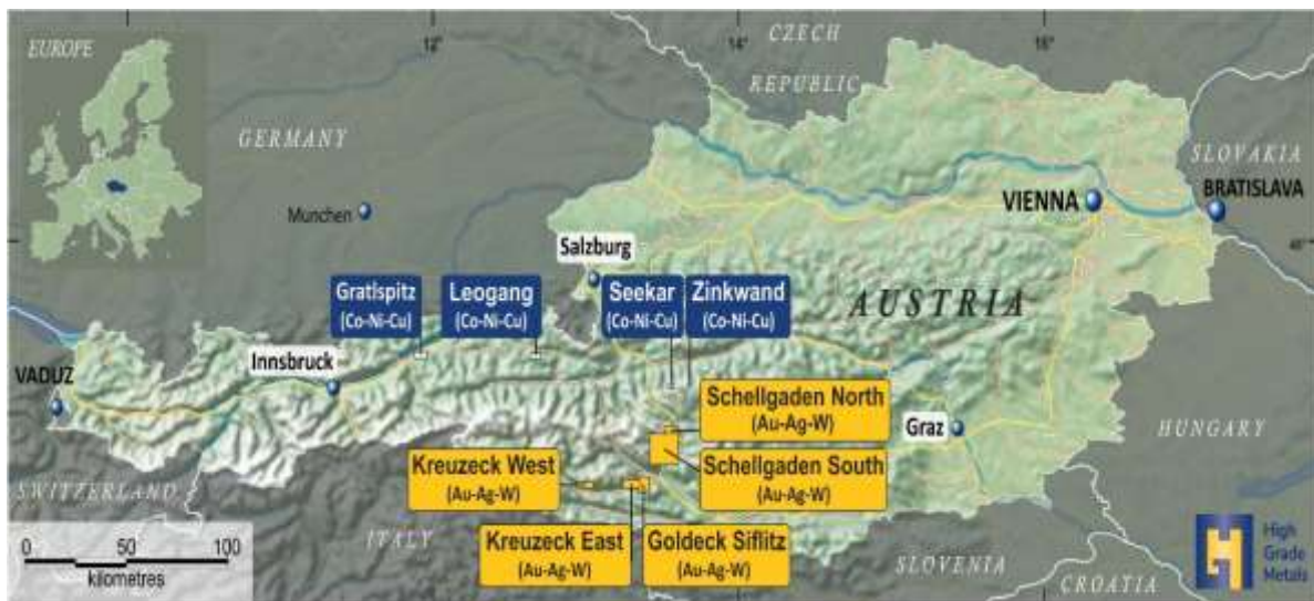
Figure 1. Location of High Grade Metals' Projects within Austria

High Grade Metals (ASX: HGM) is an Australian mineral exploration company with a portfolio of brown fields cobalt, copper and gold assets. The Company's major projects are all located in mining friendly Austria, which covers an area of about 84,000 km 2 across Central Europe. The highly experienced management aims to grow the value of HGM's project portfolio to benefit shareholders by leveraging innovation and maximizing value of the assets through systematic exploration and teamwork. The dynamic two-year exploration and development program underpins the Company's business strategy.