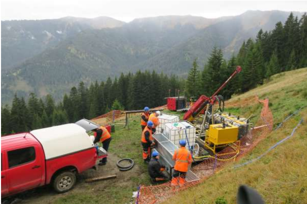
Figure 2 – Rig 1 commencing drilling at Leogang on 3 rd October