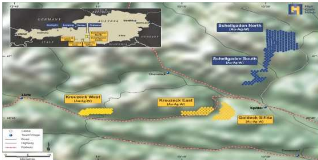
Figure 2: Location map showing the Company's Austrian Gold Projects

The project lies within an exploration area of 44 overlapping Freischürfe covering an area of 23.9km 2 . The projects also sits within the Goldeck-Kreuzek Mining District and includes for significant historical mines; Rabant, Gurskerkammer, Fundkofel, and Knappenstube-Strieden.