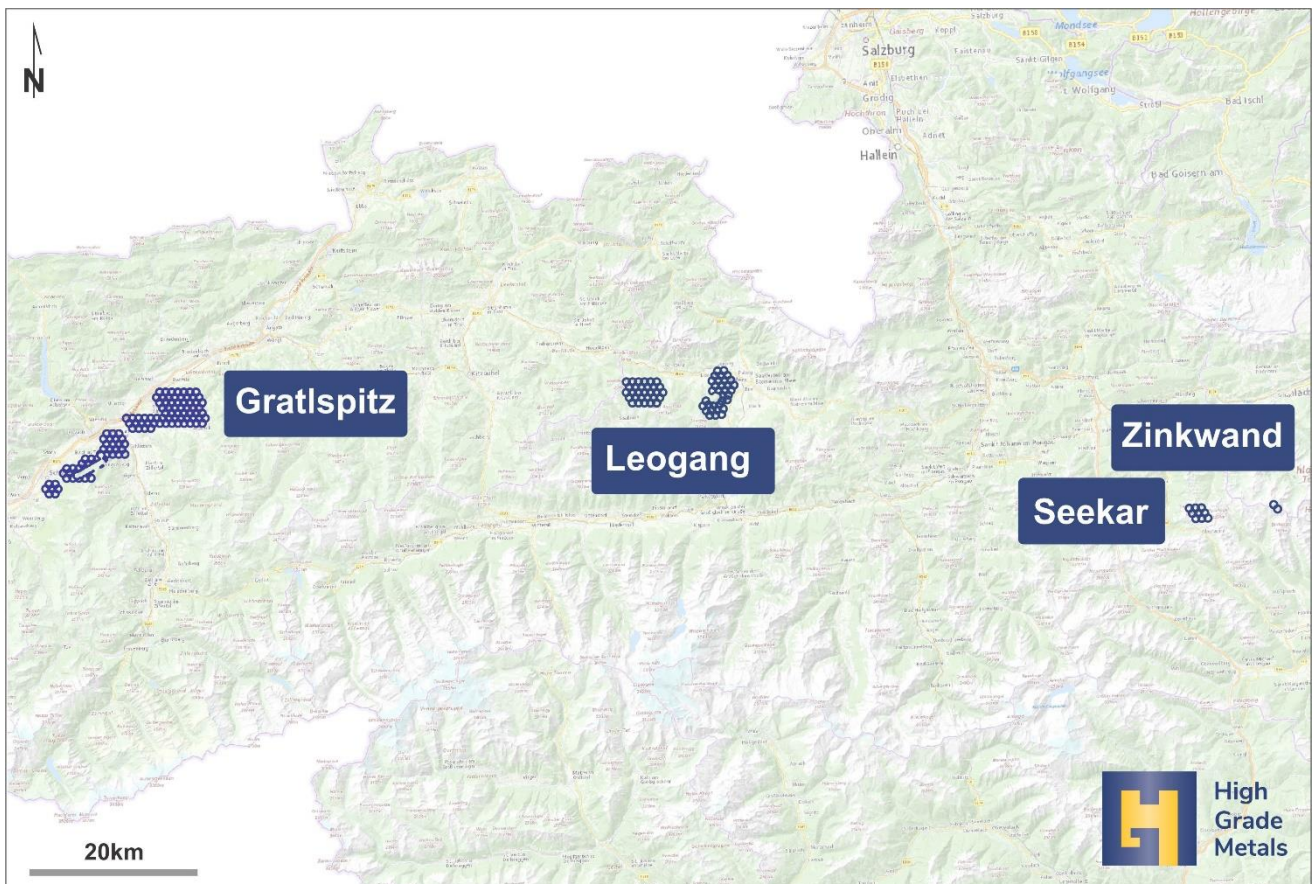
Figure 3 – Location map showing the Company’s Cobalt, Copper and Nickel Projects in Austria

The project covers the site of historic sulphide mining including both cobalt and nickel. Several historical mining adits are still accessible within the project area.