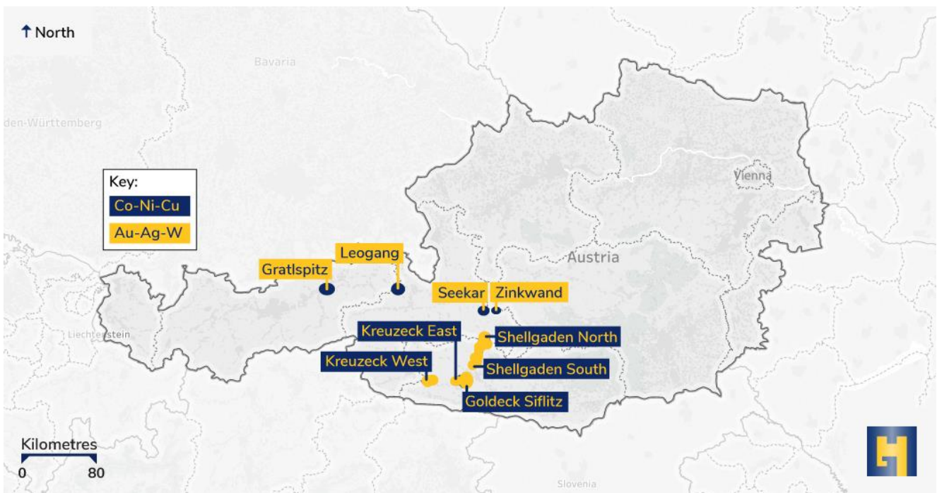
Figure 1. Location of High Grade Metals' Projects within Austria

High Grade Metals (ASX: HGM) is an Australian mineral exploration company with a portfolio of brown fields cobalt, copper and gold assets. The Company's major projects are all located in mining friendly Austria, which covers an area of about 84,000 km 2 across Central Europe. The highly experienced management aims to grow the value of HGM's project portfolio to benefit shareholders by leveraging innovation and maximizing value of the assets through systematic exploration and teamwork. The dynamic two-year exploration and development program underpins the Company's business strategy.